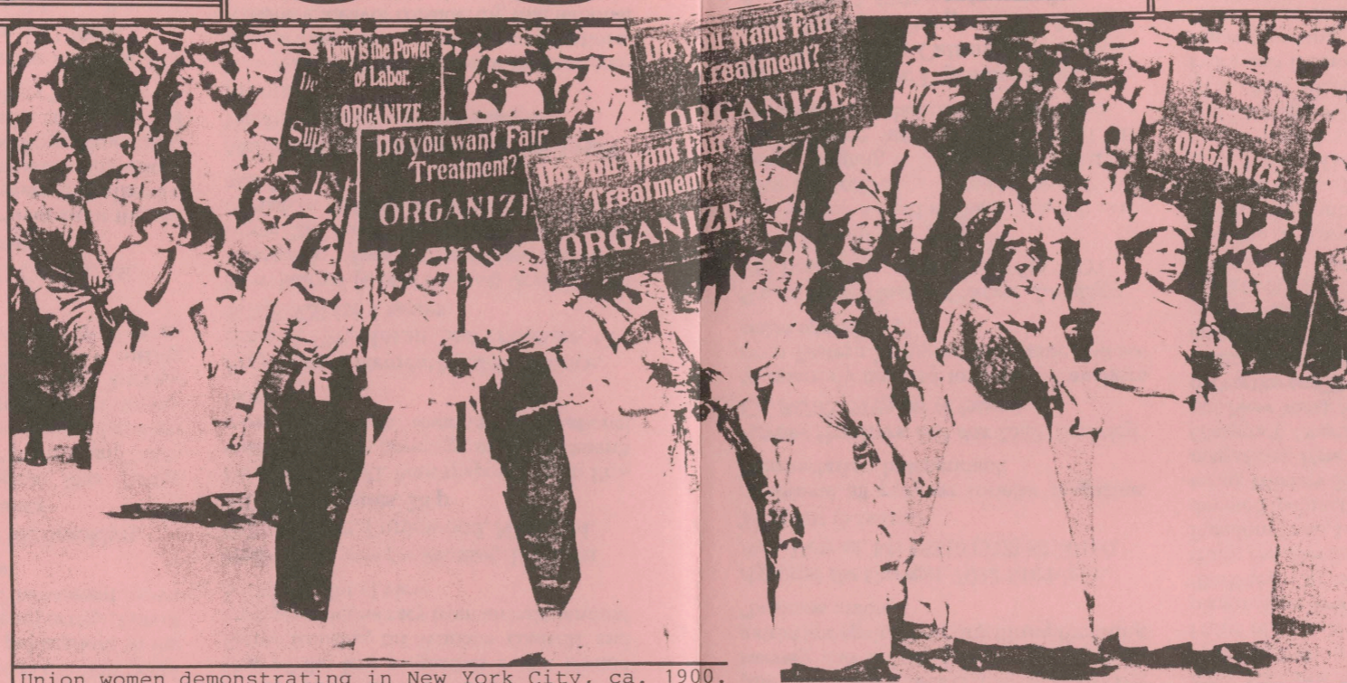
Union women demonstrating in New York City, ca. 1900.

Mon 5 7:00 pm - 9:00 pm Tax Resistance Clinic sponsored by the New England War Tax Resistance. At the Community Church, 565 Boylston ST, 3rd floor, Boston. Info: 731-6139